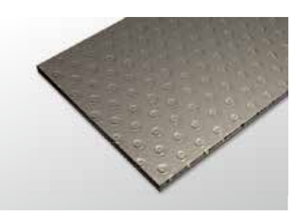
Strips P20, P22*, P23*, P200, P202*, P203*