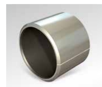
Bushes P10, P10Bz*, P14, P147*