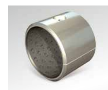
Bushes P20, P22*, P23*, P200, P202*, P203*