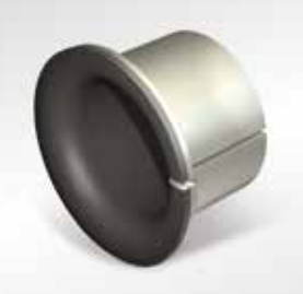
Flange bushes P10, P10Bz*, P14, P147*